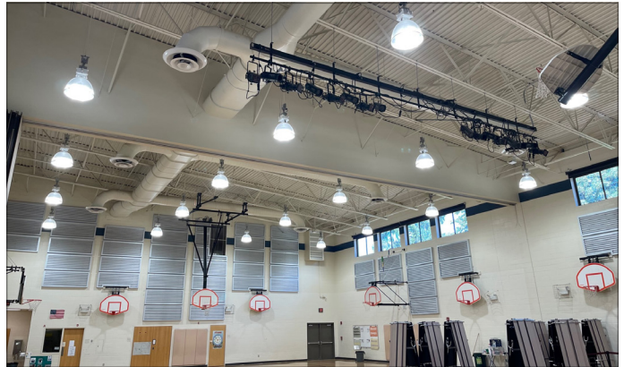
An LED lighting retrofit project in the gym at Lake Hills Elementary.