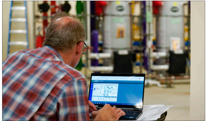
An energy dashboard allows Tweeten to monitor energy use at each building site within Bellevue School District.

HVAC/utilities control specialist at BSD