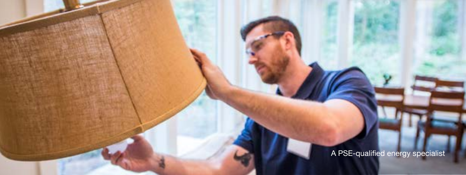
A PSE-qualified energy specialist